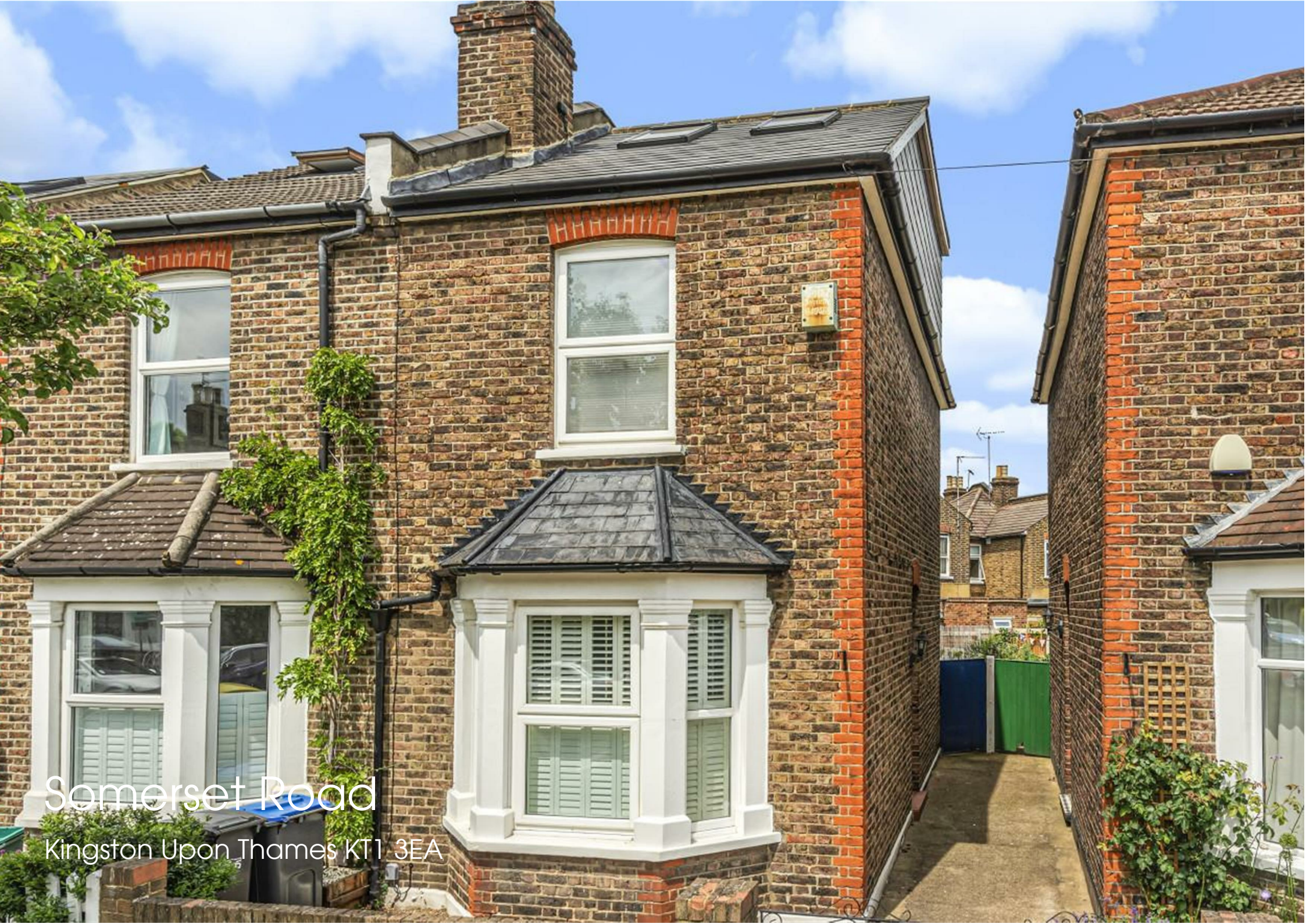
Somerset Road Kingston Upon Thames KT1 3EA